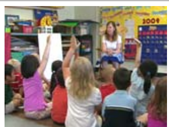
Ontario will phase in full-day kindergarten, which is for four- and five-year-old children, across the province.